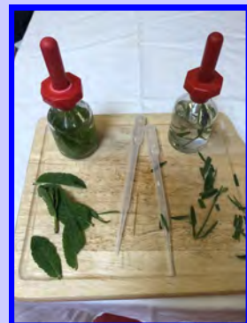
Once again the Science Dept ran a SciFest STEM fair